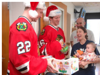
Blackhawks visiting Children's Hospital.

Each season, Chicago Blackhawks players and coaches visit local children's hospitals to sign autographs, pose for photos, participate in games or craft activities and interact with children.